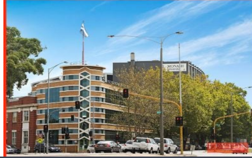
949 Dandenong Road MALVERN EAST