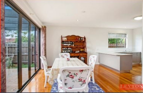
3/29 Regent Avenue SPRINGVALE