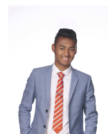
E Sha Hat