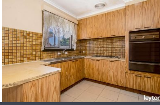
4 Clayton Court SPRINGVALE SOUTH