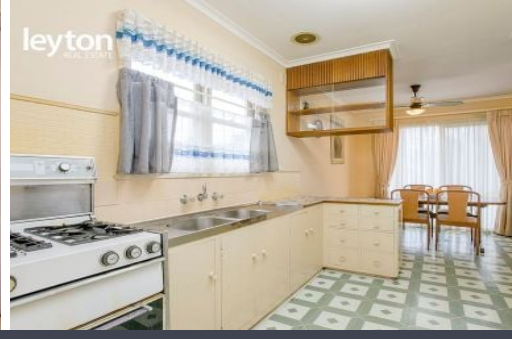
37 Green Street NOBLE PARK