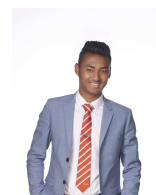
E Sha Hat

Auction: Saturday, 26 October at 1PM - if not sold prior