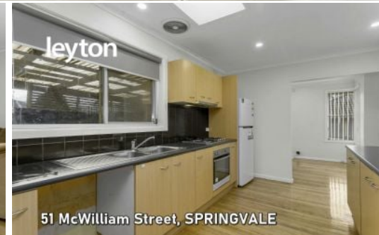
51 McWilliam Street, SPRINGVALE