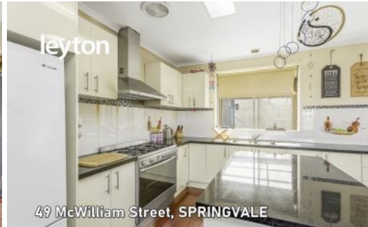
49 McWilliam Street, SPRINGVALE