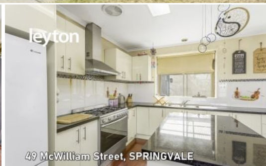
49 McWilliam Street, SPRINGVALE