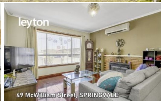
49 McWilliam Street, SPRINGVALE