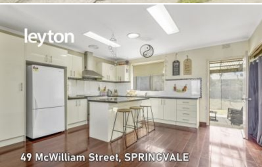
49 McWilliam Street, SPRINGVALE