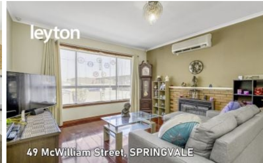
49 McWilliam Street, SPRINGVALE