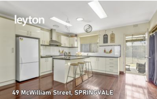
49 McWilliam Street, SPRINGVALE