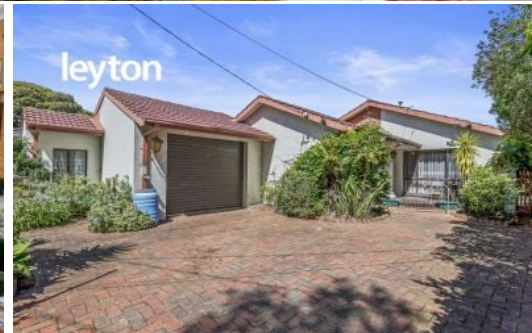
14 Lucian Avenue SPRINGVALE