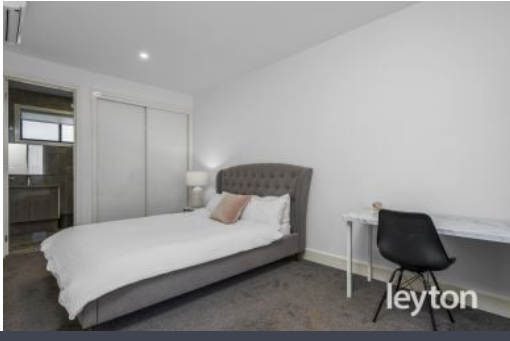
2/1022 Heatherton Road NOBLE PARK