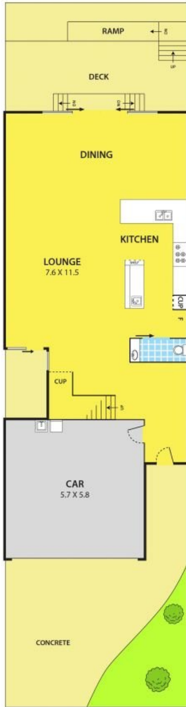
GROUND FLOOR 7.9M