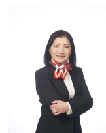
Photo ID Required for all Inspections